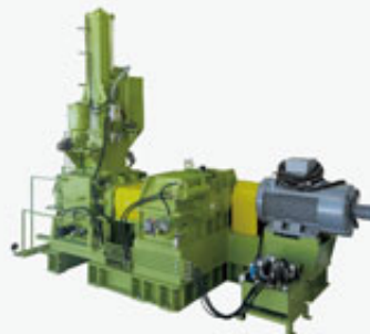
Intensive Mixer 下落式密練機 (密閉式混合機)