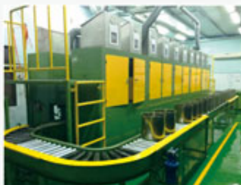
Chanical Auto Weighting Device 微量自動計量