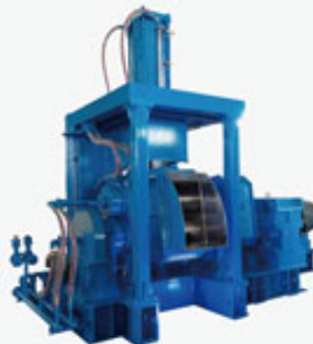
Intermesh Dispersion Kneader 咬合式密練機