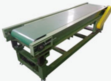
Scale Conveyor 皮帶磅秤