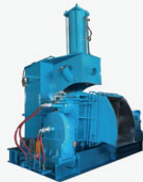
Air Ram Dispersion Kneader 空壓式密練機