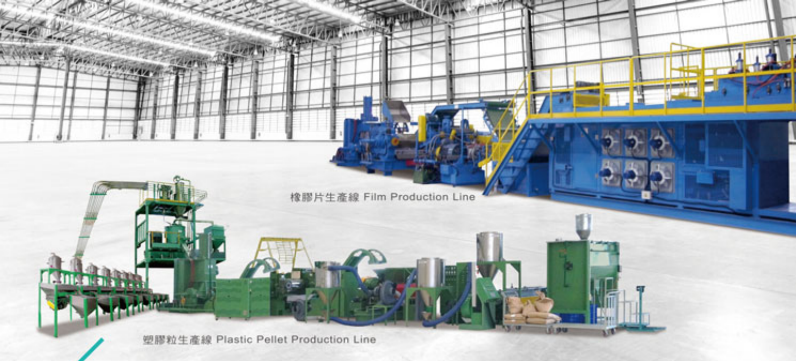
橡膠片生產線 Film Production Line