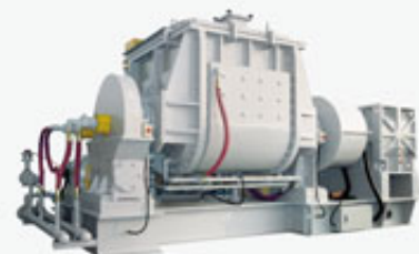
Open Kneader 非加壓式密練機

36 Years Specialized Design & Production Leading the Industry, the Turnkey Project Manufacturer & Exporter