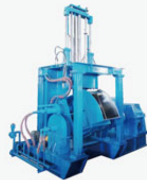
Hydraulic Ram Dispersion Kneader 油壓式密練機