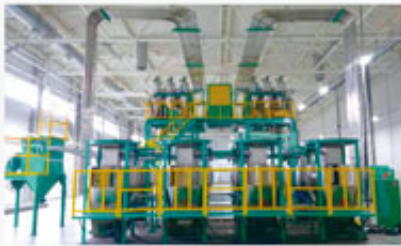
Majority Quantity Auto Weighting Device 大用量自動計量