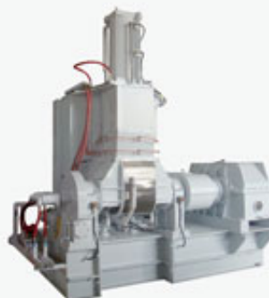
Big Rotor Dispersion Kneader 大攪拌軸密練機