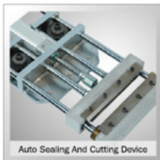
Auto Sealing And Cutting Device