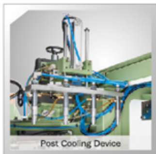
Post Cooling Device