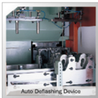
Auto Deflashing Device