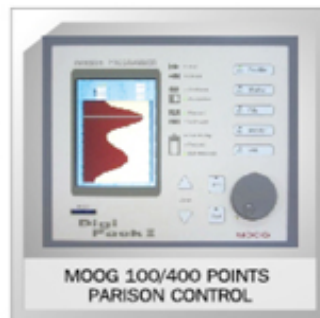
MOOG 100/400 POINTS PARISON CONTROL