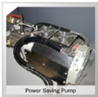
Power Saving Pump