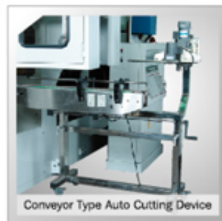
Conveyor Type Auto Cutting Device