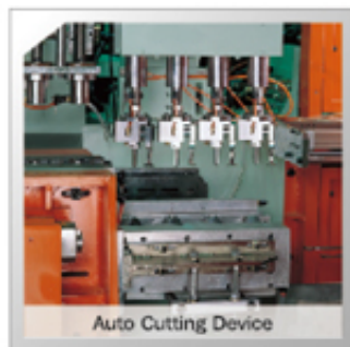
Auto Cutting Device