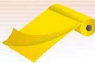
Star seal bag