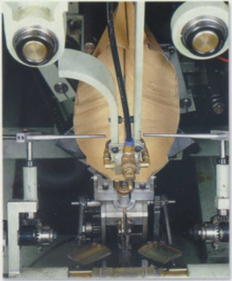
Paper Bag Folding Machine PAT. ENT. 82366

DSM-3 THE Model DSM-3 is a double-head sewing machine best suited to the production of valve type cement bags. Both ends of a tube are sewn simultaneously by two sewing machines installed on the right and left (NL DN-2HS and NL DN-2LHS). Crepe tape is automatically cut to a fixed length by NLC or NLC-L.