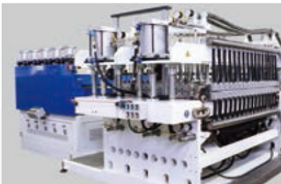
T-Die Head & Vacuum Calibration Unit