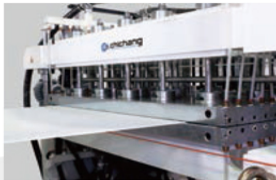
Vacuum Calibration Unit