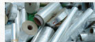
PET film roll / PET膜