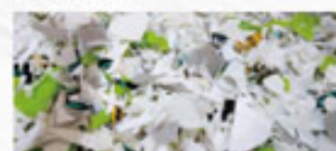
PE foaming and crushing edge material / PE發泡粉碎邊料