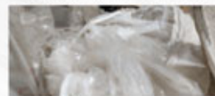
PE film / PE膜