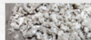
PE washing and squeezing dry film / PE膜水洗擠乾料